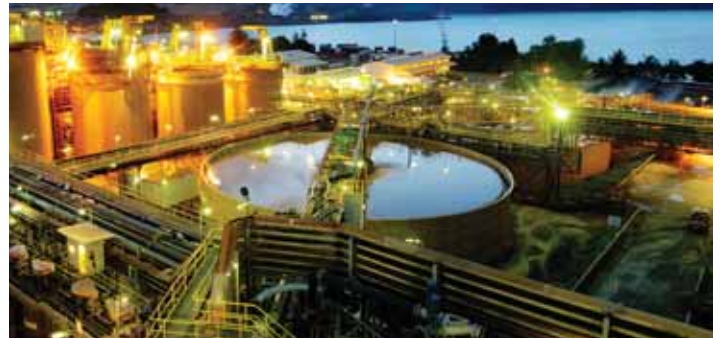
Lihir Gold Mine, Papua New Guinea, 2007: Versatility made Interzone® 954 one of the key products chosen for this major project.